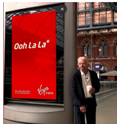
Extract from Sir Richard Branson's video at London St Pancras (30 Oct 2025).

Link to the film: All abroad! Virgin is on track to launch a rival train service through the Channel Tunnel | Virgin