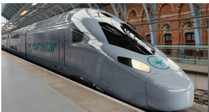
Future Eurostar Celestia train at Paris-Nord, London St Pancras or Brussels Midi station. Image generated by artificial intelligence.

Link to the press release: Eurostar Media Centre